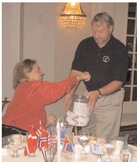
A guest adds her raffle into the "pot" for a chance to win one of the three prizes donated to us by Finlandia, Dane Decor and Icelandair.