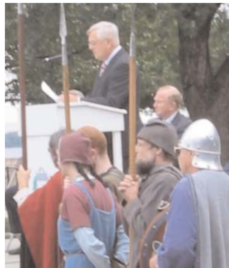
Congressman Curt Weldon speaks to the crowd as the "guard" stand watch.